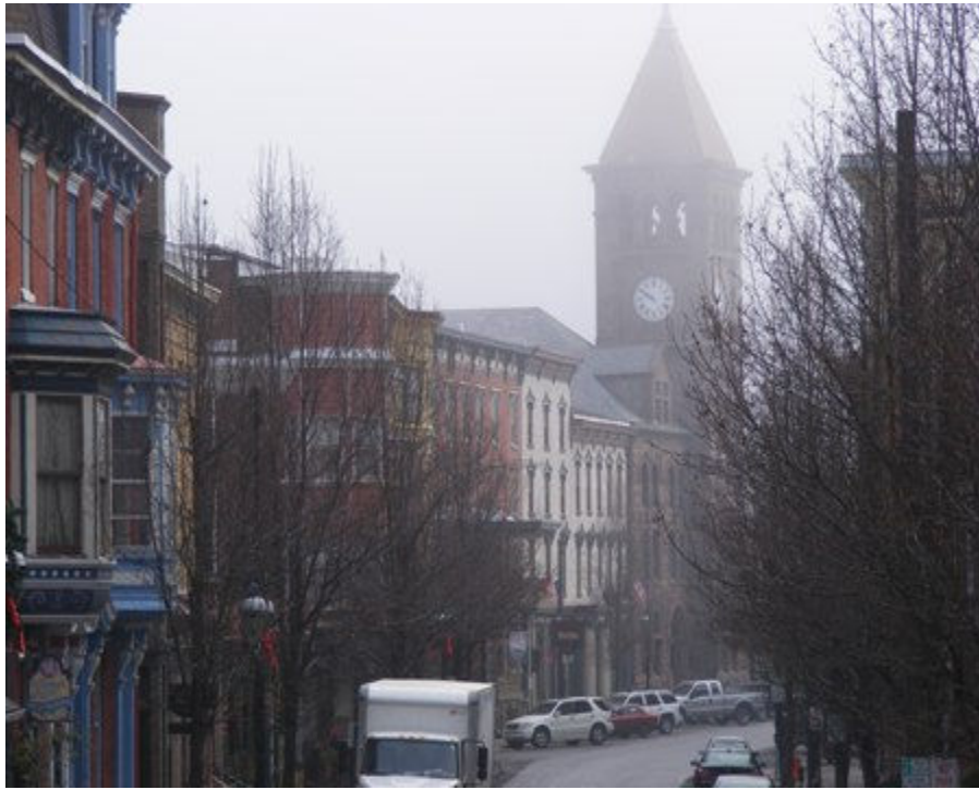
Millionaires' Row, Jim Thorpe, Pa

Finally we depart and though the day is waning we elect to also visit the other end of this massive coal vein which is located beneath the former town of Centralia. The vein caught fire in the 60's and still burns, forcing the melting road to be rerouted and the town to be evacuated and bulldozed. From here we cruise directly by the huge wind mills that we saw in the distance from the coal mine. Now we can hear the 'whoop-whoop' as the huge propeller blades cut through the air at high speed.